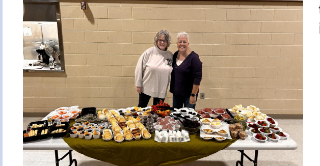
time. Look for a future event coming in June/July 2025.